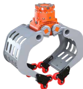
optional 4-Grip gripping device, here mounted to a D09HPX