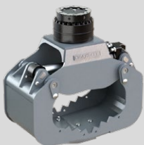
A04H 2 - 4 METRIC TONS

Machine weight: 6,000 - 9,000 kg / 13,200 - 19,800 lb