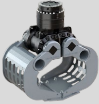
D04HPX 2 - 4 METRIC TONS

Machine weight: 2,000 - 4,000 kg / 4,400 - 8,800 lb