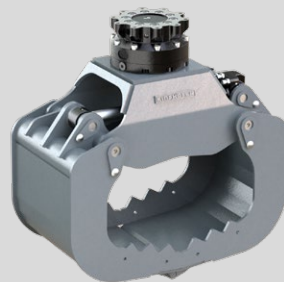
A09H 6 - 9 METRIC TONS

Machine weight: 3,000 - 6,000 kg / 6,600 - 13,200 lb