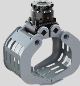
D09HPX 6 - 9 METRIC TONS

Machine weight: 3,000 - 6,000 kg / 6,600 - 13,200 lb