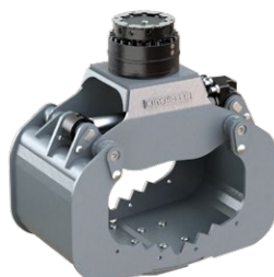
A06H 3 - 6 METRIC TONS

Machine weight: 2,000 - 4,000 kg / 4,400 - 8,800 lb