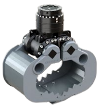
A04HPX 2 - 4 METRIC TONS

Machine weight: 2,000 - 4,000 kg / 4,400 - 8,800 lb