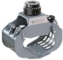
D04H 2 - 4 METRIC TONS

Machine weight: 6,000 - 9,000 kg / 13,200 - 19,800 lb