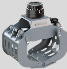
D06H 3 - 6 METRIC TONS

Machine weight: 2,000 - 4,000 kg / 4,400 - 8,800 lb