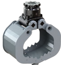
A09HPX 6 - 9 METRIC TONS

Machine weight: 3,000 - 6,000 kg / 6,600 - 13,200 lb