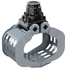
D06HPX 3 - 6 METRIC TONS

Machine weight: 2,000 - 4,000 kg / 4,400 - 8,800 lb