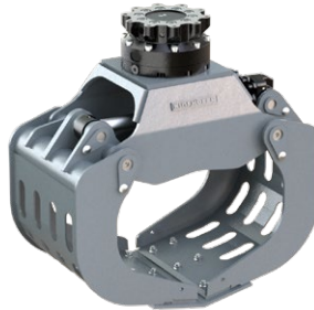
D09H 6 - 9 METRIC TONS

Machine weight: 3,000 - 6,000 kg / 6,600 - 13,200 lb