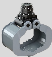
A06HPX 3 - 6 METRIC TONS

Machine weight: 2,000 - 4,000 kg / 4,400 - 8,800 lb