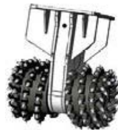
PROFILING (available upon request)