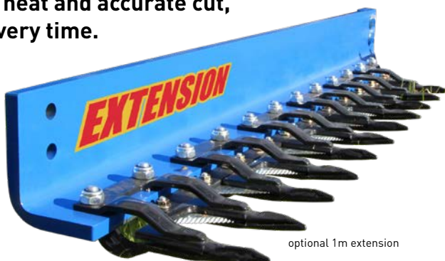
optional 1m extension